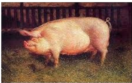
BRANDYWINE RIVER MUSEUM CHADDS FORD, PENNSYLVANIA

Founded in 1824 as Jefferson Medical College, Sidney Kimmel Medical College of Thomas Jefferson University has awarded more than 31,000 medical degrees and has more living graduates than any other private medical school in the nation. It was the first U.S. medical school to incorporate bedside teaching of physicians in the late 1800's. In 2014, the Sidney Kimmel Foundation donated $110 million to Jefferson Medical College, prompting the name change to Sidney Kimmel Medical College. Historically, Jefferson expanded from a medical school to a larger health sciences university that included biomedical research facilities, and schools of nursing, pharmacy and other allied health professions. In 2017, Thomas Jefferson University and Philadelphia University, formally known as the Philadelphia College of Textiles & Science and originally founded in 1876, merged, creating a comprehensive undergraduate university, including NCAA Division II athletic teams. The main medical campus is in Center City with most of the undergraduate programs housed in our East Falls campus in Lower Northwest Philadelphia. In 2024, Jefferson held a yearlong celebration to mark its 200th anniversary.